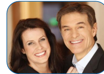
Dr. Mehmet Oz & Lisa Oz

Grace the Lives of Children & Those Who Care for Them!